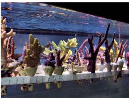
Acropora Coral Frags

The fragged pieces are placed into the Richmond Aquarium Aquaculture Center, where they are grown into new corals. These corals will eventually live in one, or many, of the aquariums in the aquaculture network. By participating in the aquaculture network, you are helping others enjoy healthy, home-grown corals while reducing the impact the aquarium hobby is having on our oceans.